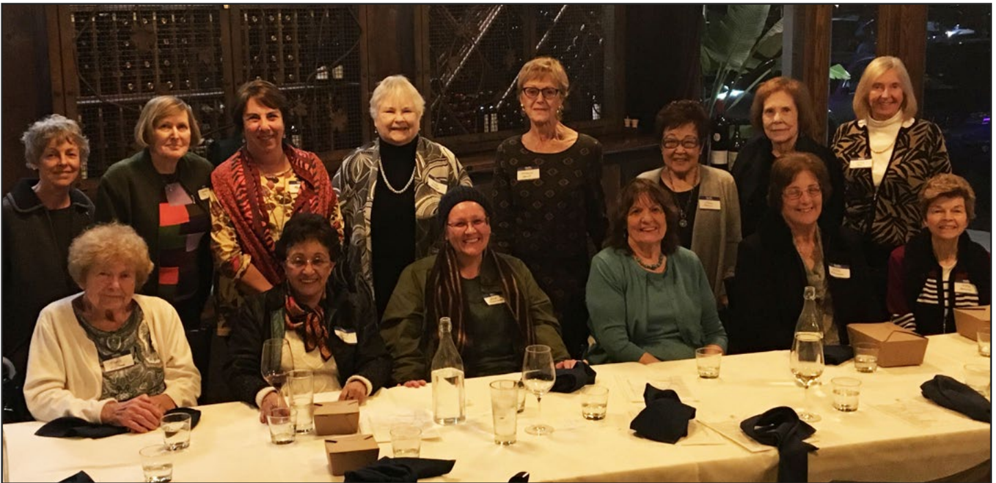
The women of Neighborhood 10 of the Mid-Peninsula branch enjoyed their holiday luncheon in January (after the Triad deadline) so here they are, with their holiday smiles, looking ahead to a healthy, wealthy and wise 2020!