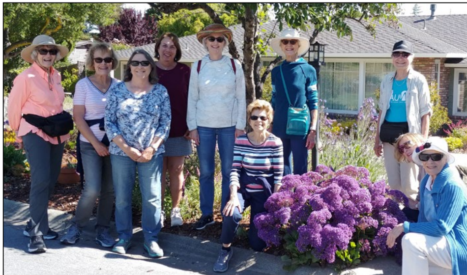
Those hikers again! This time they're admiring a plant in Hillsborough.