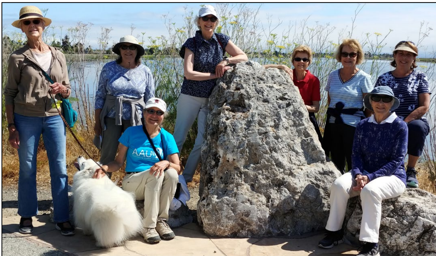
And what did the hikers do during the summer? They hiked! Here they are next to the lagoon in Redwood Shores.