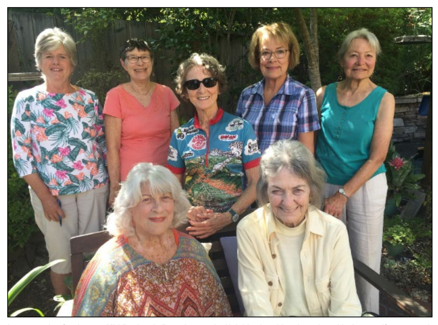
In preparation for the new Mid-Peninsula Branch year, the Neighborhood Leads gathered in August. If you weren't able to pick up your directory at the September event at Burton Park, you should expect to receive one from your Neighborhood Lead. She will be the person corraling the members of your neighborhood for activities all year.