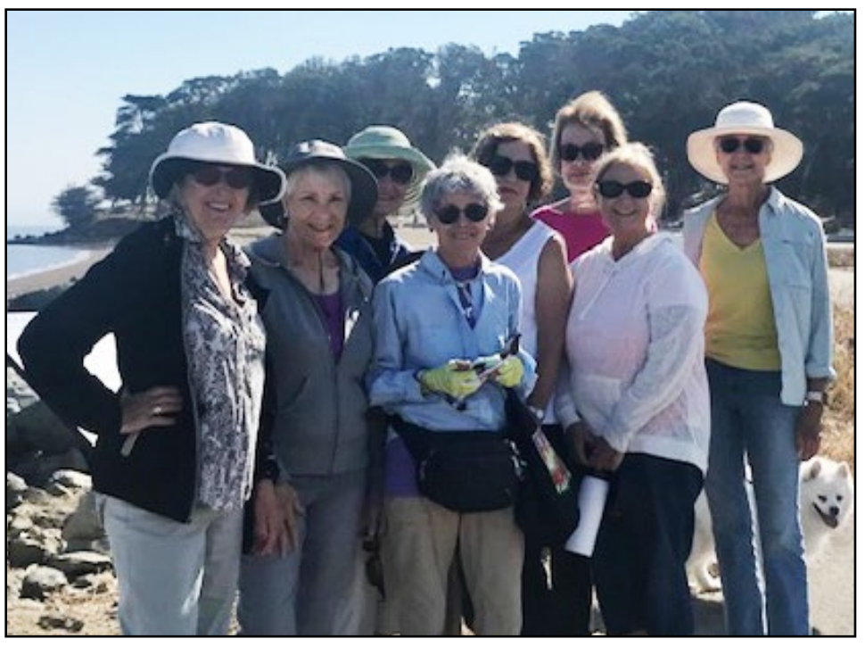
Coyote Point was the destination for Walk/Talk & Gawk in August.

The new section Hilly Hikers, which will be meeting monthly on the fourth Friday, was scheduled to start on Sept. 23 at the mosaic tiled stairway in San Francisco.