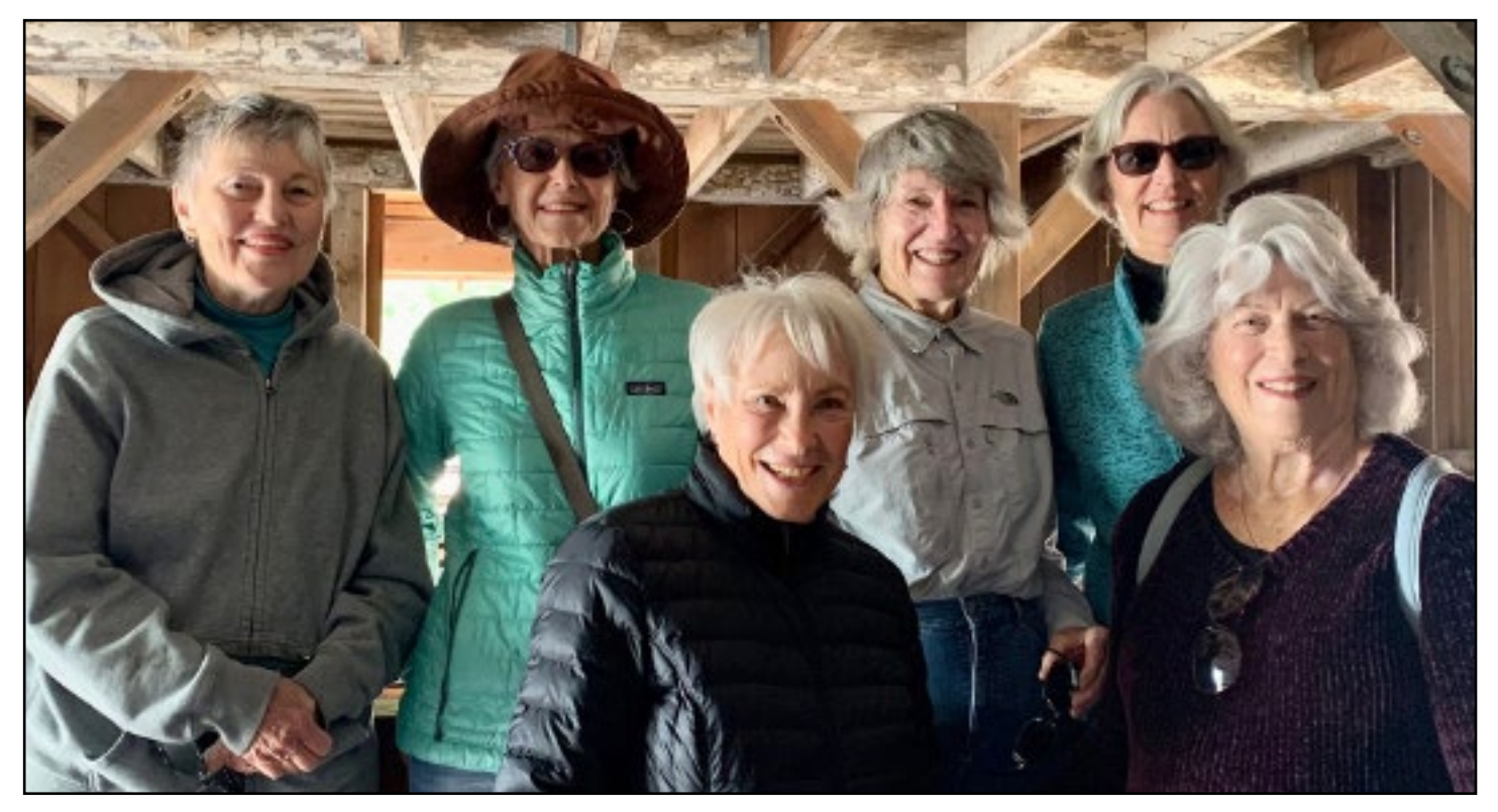
The Climate and All About Food sections of Mid-Pen Branch enjoyed a summer visit to the Pie Ranch in Pescadero to learn about its unique approach to working the land. The story and another photo appear on Page 7.