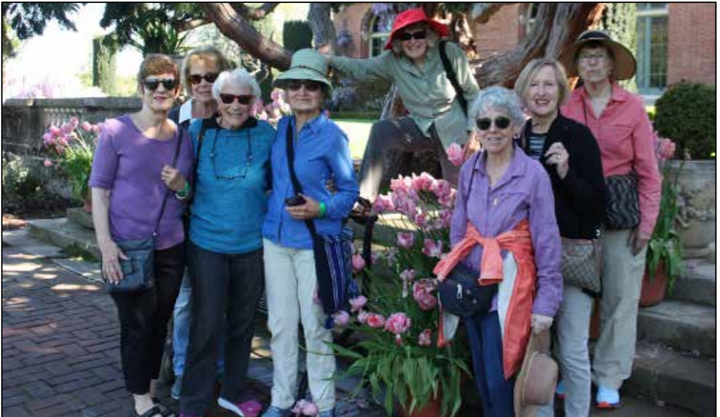
Members of Walk/Talk & Gawk made a springtime visit to Filoli to ogle the tulips and other seasonal blossoms.