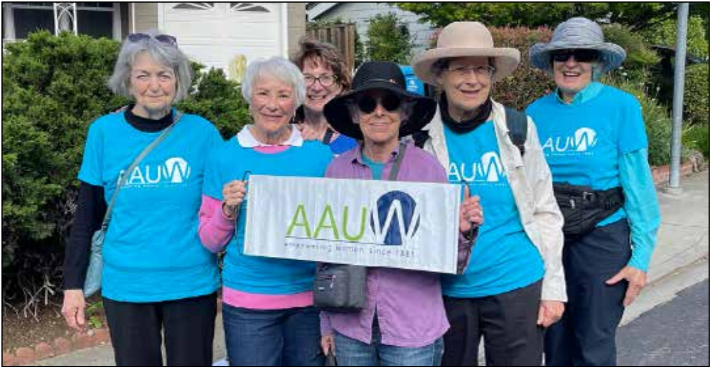
Saturday, May 18, began early for some Mid-Pen members as they gathered to walk in San Carlos' Hometown Days Parade (right in front of the Carmont High School cheerleaders!). Next year, they will bring pom-poms!