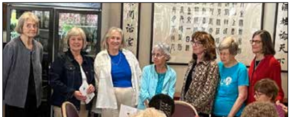
Officers for 2024-2025 were installed at a luncheon in San Carlos.

"When AAUW moved to a hybrid model of collecting dues, the job of Membership Treasurer became a juggling act.