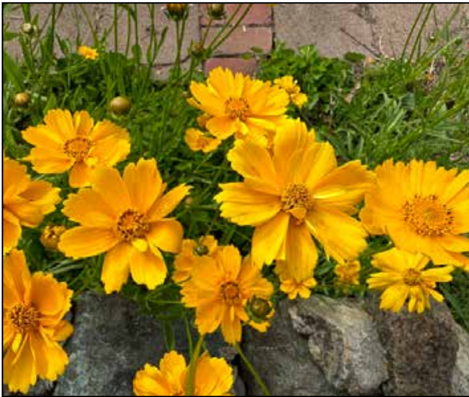
A bit of spring from Chris Panero's garden.